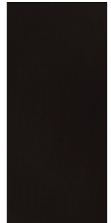
Black Top Coat